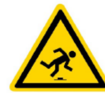
Beware of falling