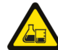
Loaded with chemicals