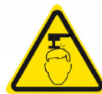
Watch your head